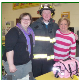
Emergency Medical Services